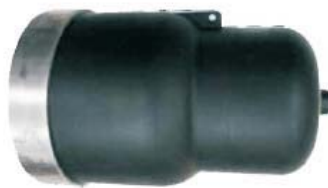
Type: APCV-3 35kV Energized Protection Cap