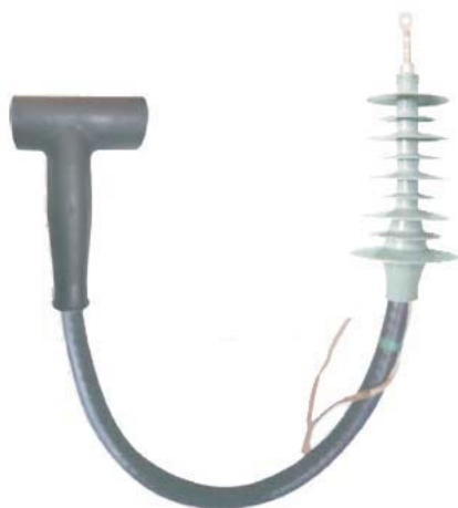
Type: AWSY35-□ 35kV Test cable