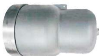
Type: APC-3 35kV Non-energized Protection Cap

35kV Energized protection cap protects the energized inner cone plug-in termination against electric shock. It also can be used for the withstand voltage test of test cable.