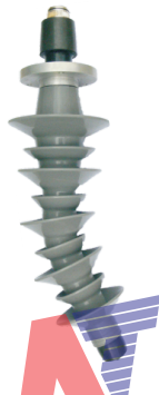
Type: ANSY35-1 (内锥测试棒 Inner cone testing pole)

35kV 1# 内锥测试棒，用于GIS系统测试时的高压引入或接地，完全替代测试电缆，可多次使用。