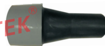
Type: ACBN-35R (35kV熔断器插头) (35kV fusegear connector)